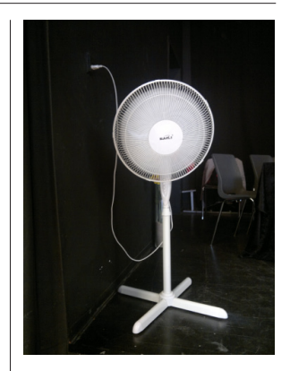
Next to a partner this device became the best friend of the dancers during the afternoon milonga!

take care of your belongings for the humble sum of 10 dKr. And rest assured that they will keep an eye on them and hand them back when you leave. Hurra-hurra!